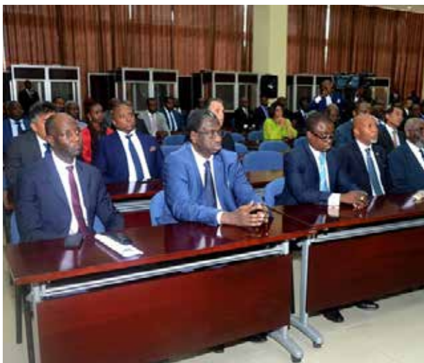
Ministers of Equatorial Guinea, ACP Ambassadors in Brussels and Members of the Diplomatic Corps in Malabo.

While the ACP Group has been actively participating in South-South and triangular cooperation over the course of its four decades of existence, it is in recent years that it has taken a concerted interest in building its capacity further and branding itself as a facilitator and hub for these modalities. This is evident in regular hosting of major conferences specifically on the topic, committed participation in international frameworks that promote South-South and triangular cooperation, mainstreaming of these modalities into the ACP Secretariat work programmes and activities, and exploration of key initiatives such as the establishment of the ACP Information Centre for South-South Cooperation in one of its member States: the Centre was officially launched in October 2018 in Malabo, Equatorial Guinea.