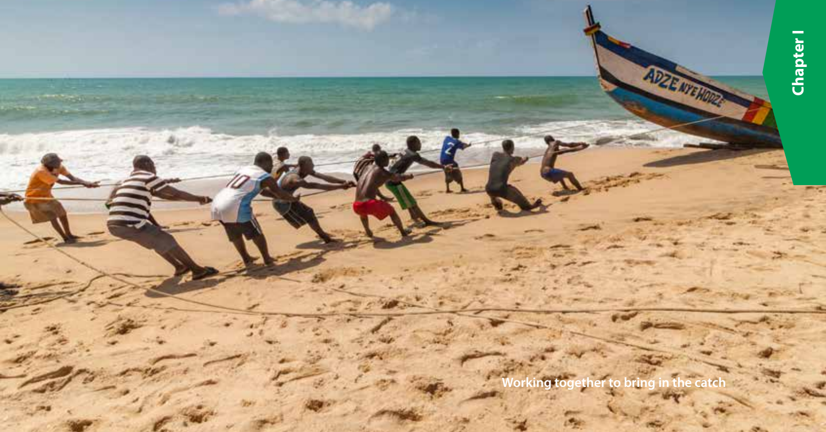
Working together to bring in the catch

knowledge, skills and technology among partners and stakeholders. South-South cooperation and triangular cooperation have the potential to transform the policies and approaches of developing countries to tackle various challenges by providing effective domestic solutions adapted to each country's circumstances. In this context, ACP countries have much to gain by sharing their experiences and expertise in dealing with the development challenges that they face, which, notwithstanding individual specificities, are often very similar. Nonetheless, they will need to acquire the necessary financial resources and platforms to facilitate this sharing of knowledge and experiences.