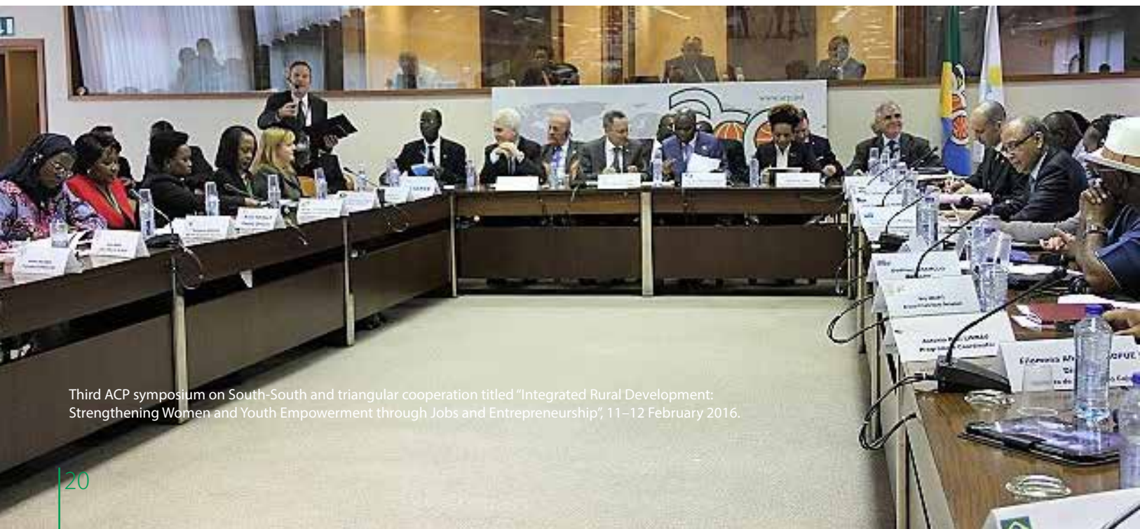
Third ACP symposium on South-South and triangular cooperation titled “Integrated Rural Development: Strengthening Women and Youth Empowerment through Jobs and Entrepreneurship”, 11–12 February 2016.

The ACP Group also played a dynamic role in various events and panels at the Global South-South Development (GSSD) Expo, spearheaded by UNOSSC, in Dubai in 2016 and is committed to continued engagement in future events.