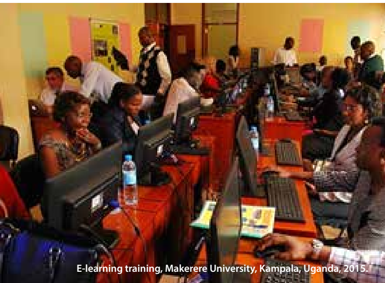
E-learning training, Makerere University, Kampala, Uganda, 2015.