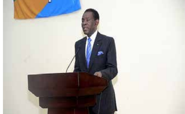
H.E. Mr. Teodoro Obiang Nguema Mbasogo, President of Equatorial Guinea.