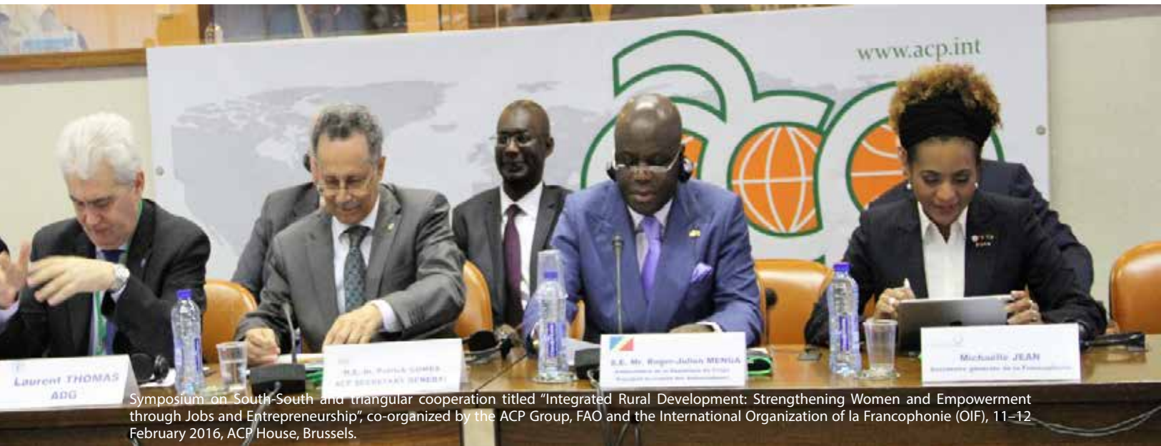
Symposium on South-South and triangular cooperation titled “Integrated Rural Development: Strengthening Women and Empowerment through Jobs and Entrepreneurship”, co-organized by the ACP Group, FAO and the International Organization of la Francophonie (OIF), 11–12 February 2016, ACP House, Brussels.

Just a year prior to the formal establishment of the ACP Group, one united group of African, Caribbean and Pacific countries had successfully negotiated a historic cooperation agreement with the European Economic Community (known as the Lomé Convention of 1975), governing trade relations and development cooperation between the two blocs. The creation of the ACP Group was thus borne out of a common realization that, in order to achieve the best possible outcome for each individual member, countries had to speak with one single voice and negotiate unwaveringly as a group, especially across a much more powerful bloc.