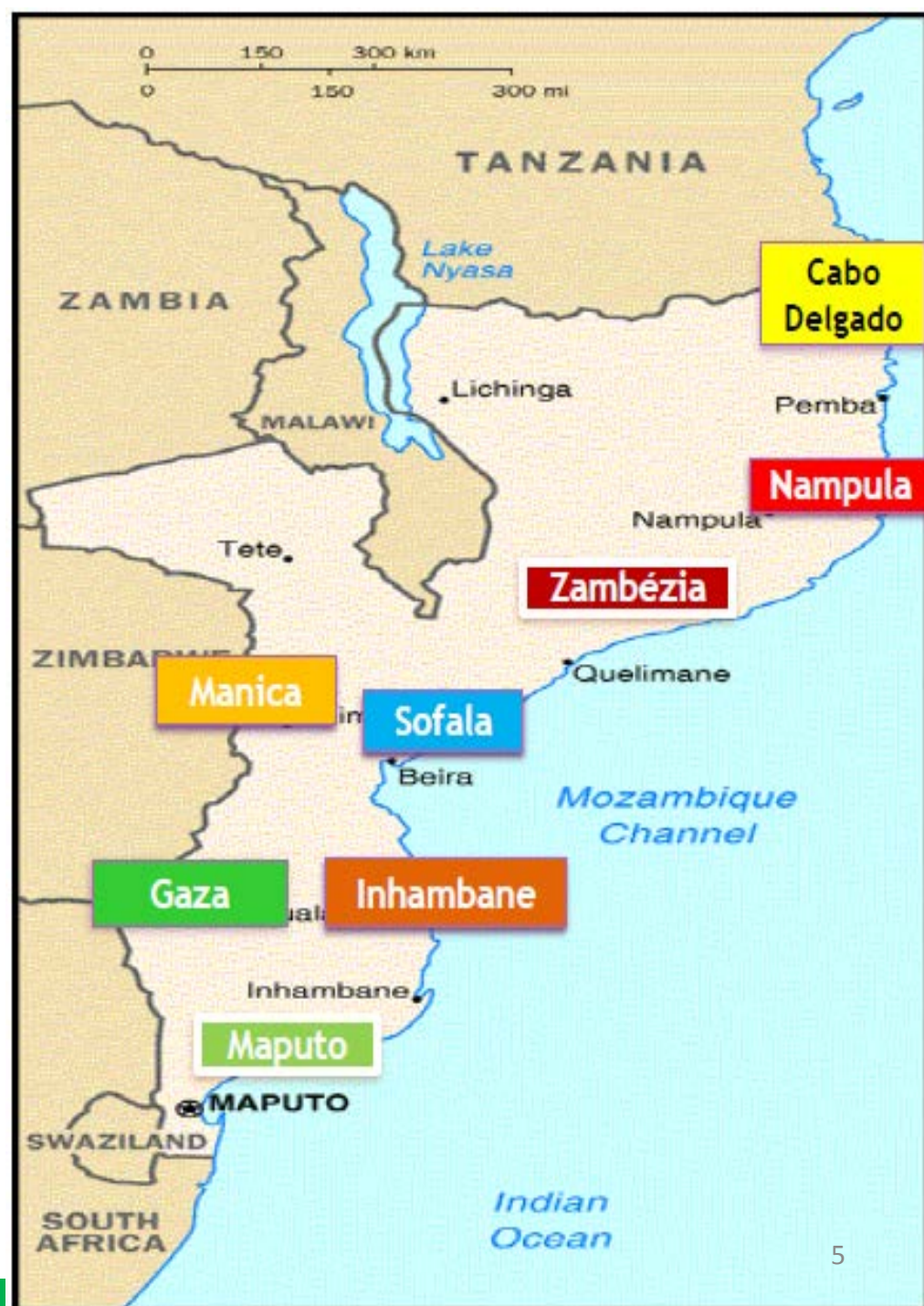
Figure 1. Geographical distribution of cashew production in the country